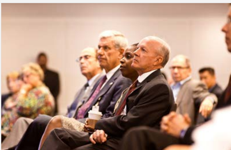
Corporate officers listened intently during the CEO Report.

But she also warned that as a result of sequestration, "we can expect the focus on meeting budgets and identifying appropriate cost-cutting measures to continue into FY14." The topic of managing costs for FY14 and FY15 was the subject of discussions with the board, she said.