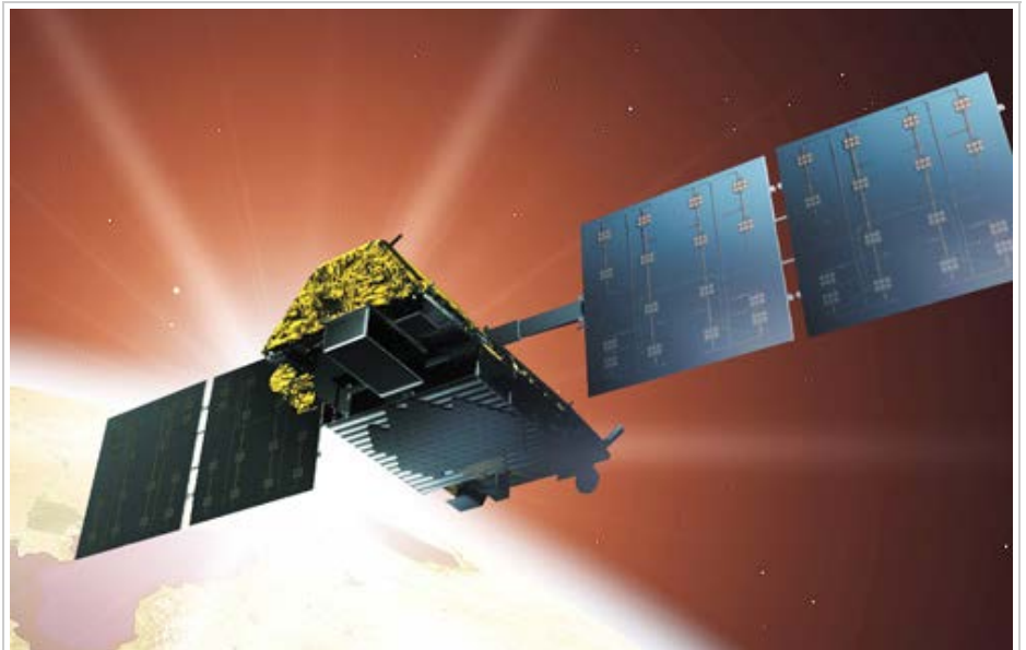
Artist's drawing of an Iridium Next satellite.

The pairing of Aerospace and Iridium Next may seem unlikely, but on a deeper level, the collaboration feels completely intuitive. Aerospace has a deep well of technical expertise that can be applied to a host of situations and critical needs. Numerous