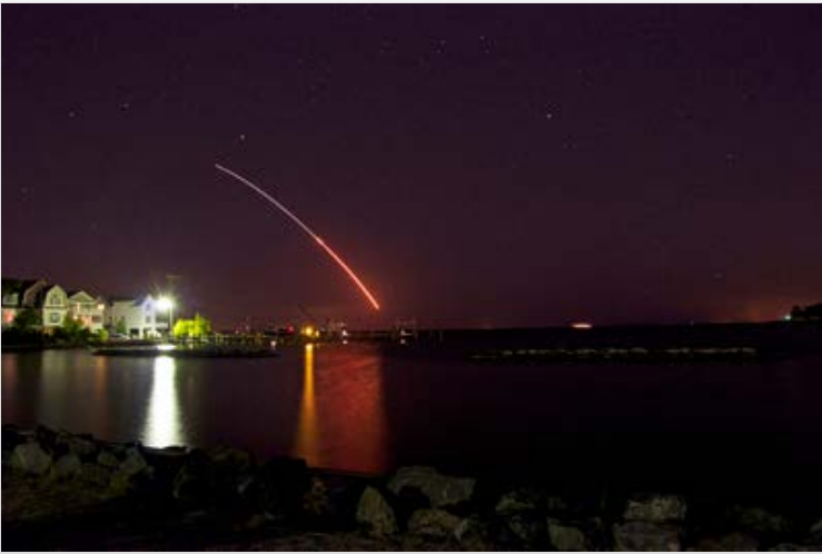
The launch of NASA's LADEE mission caused a sensation on the East Coast of the United States. This photograph was taken in Annapolis, Md.