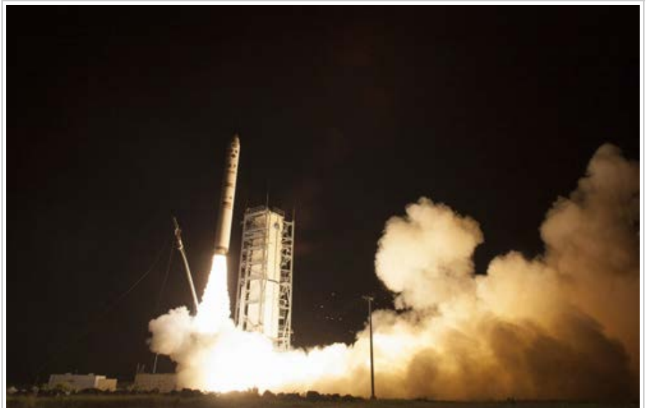
NASA's Lunar Atmosphere and Dust Environment Explorer satellite launches aboard a Minotaur V rocket on Friday, Sept. 6.

The Minotaur V is a five-stage space launch vehicle designed, built, and operated by Orbital for the U.S. Air Force. It uses three decommissioned Peacekeeper government-supplied booster stages that Orbital combines with commercial motors for the upper two stages.