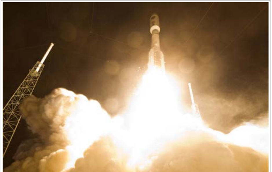
An Atlas V rocket carrying the third Advanced Extremely High Frequency military communications satellite lifts off from Space Launch Complex-41 on Sept. 18.

The rocket flew in the 531 configuration with a 5-meter diameter payload fairing, three solid rocket boosters, and one engine in its Centaur upper stage.