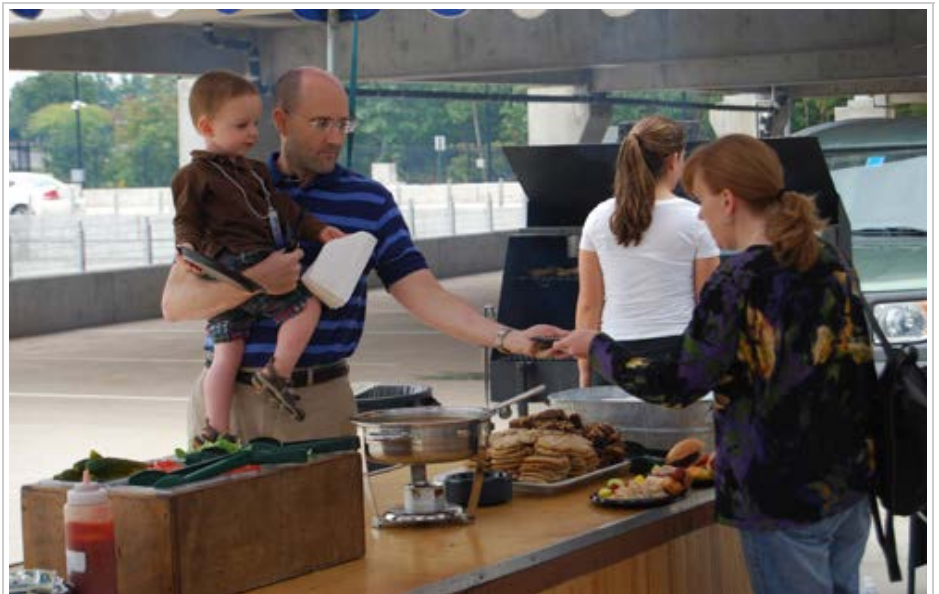
Hot dogs and hamburgers were on the menu for lunch at the Chantilly Family Day.