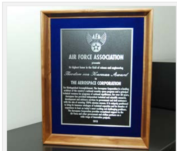
Theodore von Karman Award plaque.